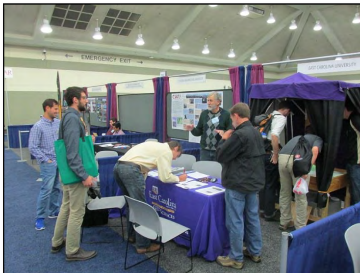
Prospective students viewing the sand box at this annual GSA meeting in Baltimore.