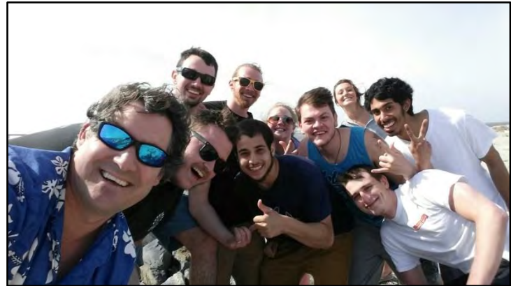
Some Advanced Oceanography students and I gather for a selfie at the Oregon Inlet.