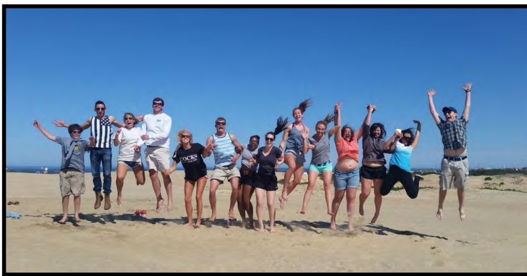
Students enjoying a day at Jockey’s Ridge.

Cover Photo; Bailey Donovan, mangrove ecosystem from the east coast of the southern South China Sea