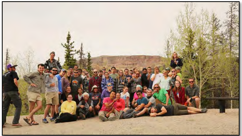
Summer 2015 Field Course students and staff.

As Director of the North Carolina Summer Geology Field Course I will be teaching in New Mexico and Colorado in May-June, 2016 for the 18 th straight year. For 2016, the enrollment in the field course will be 42-43 students. Twenty-two of these students will be from the ECU geology program, indicative of the recent growth in Geology Majors in our current program. Currently, the visiting students from other universities hail from UNC-Chapel Hill, UNC-Charlotte, Appalachian State University, University of Pittsburgh, Virginia Tech, Mississippi State University, University of Southern Mississippi, University of Texas-San Antonio, Grand Valley State University, Missouri, and University of Tulsa.