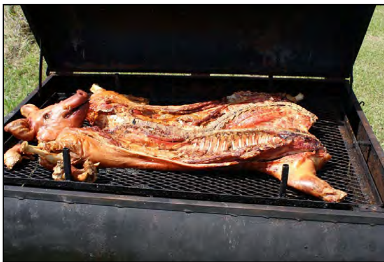
A pig in need of pickin'

As in previous years, we will host the annual Pig Pick'n at our place and we look forward to seeing you there! Details are in this newsletter. And please plan to participate in our upcoming 50 th Anniversary celebration in 2017--we need your support.