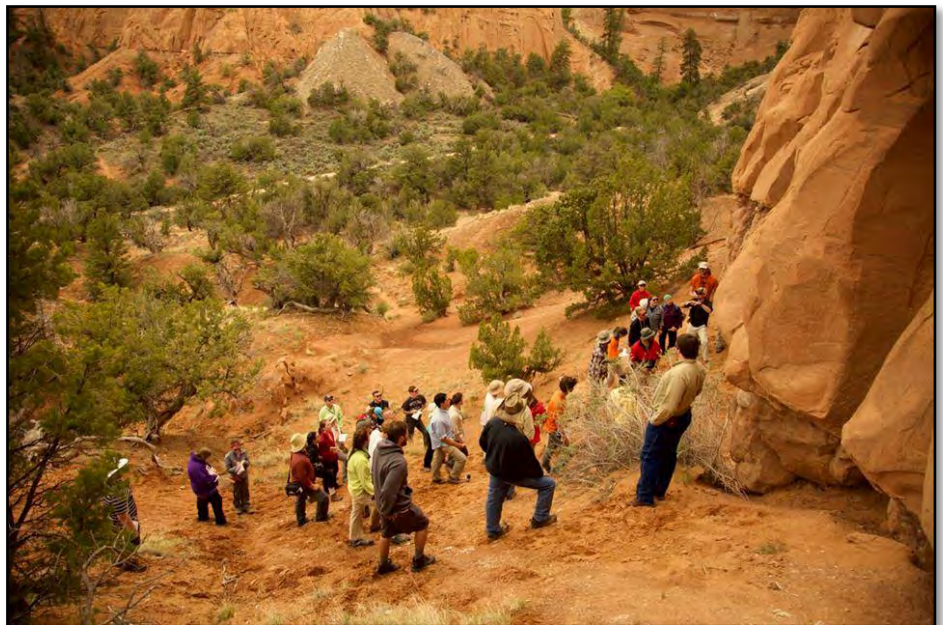
Students viewing an outcrop in New Mexico.