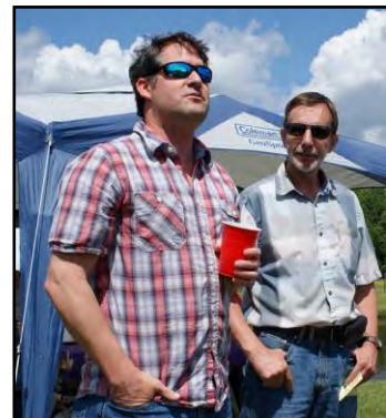
Photos from past Pig Pickings