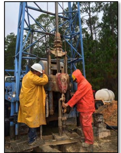
Working on a drill rig in South Carolina.

Right now I am trying to balance work and studying to take the ASBOG licensing exam in March. I look forward to seeing some fellow pirates at GSA in Columbia!