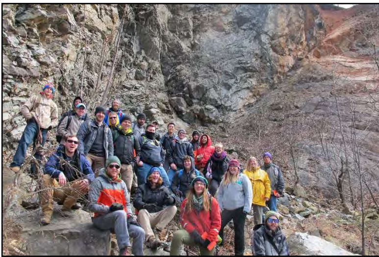
Students viewing a fault in the Appalachian Mountains.