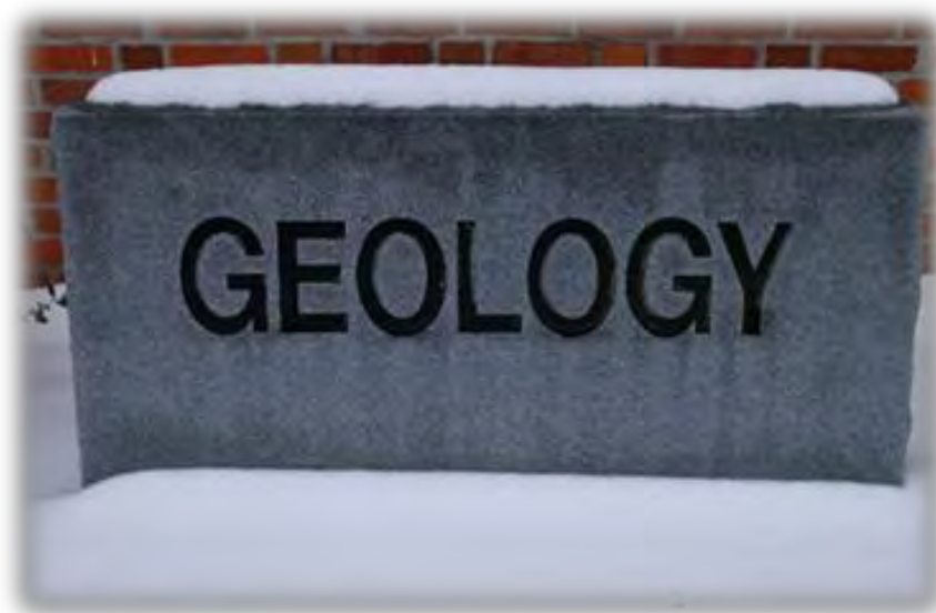
The "Geology Rock" situated on the north side of the Graham Building. Photo was taken during a Feb. 2015 snow.