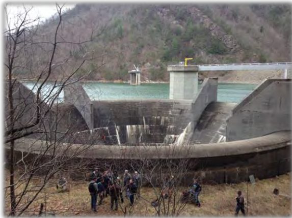
The Sarlacc Pit! It was actually an emergency reservoir for the dam, but the resemblance was too much to ignore.

Isaac Bukoski – B.S. Geology, Summer 2015