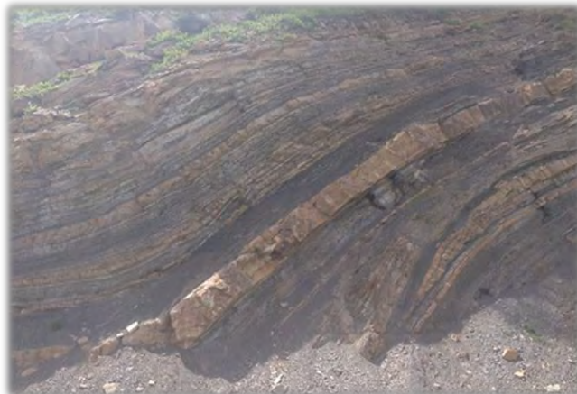
A roadside outcrop of the Hermosa Formation monocline within the San Juan Mountains, Durango, CO

Field course further develops the skills learned in Field Methods and Structural Geology. Approaching an unknown outcrop and mapping it with confidence is a huge turning point for a geology student. The team work it takes and the camaraderie that is built plays no small part in field course. Working in teams is an important skill to have, and I can say that field course certainly gave everyone that experience, good or bad. Part of the field camp experience and becoming a geologist is being paired with someone with whom it is difficult to work with. My experiences at field camp were some of the best moments in my life, and that is in part because of the people and the professors who were involved, but mostly because I knew I had become a better geologist.