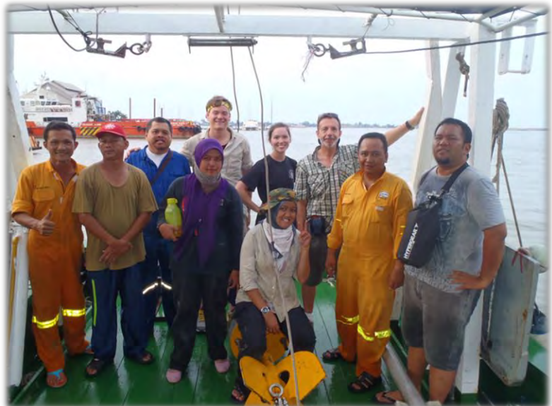
Crew of the Discovery II in Malaysia after a long day of fieldwork in the Summer of 2014