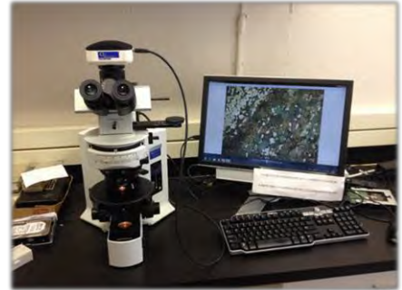
Olympus BX51 reflected/transmitted light microscope

Dr. Horsman's spring 2014 structure field trip to the Appalachians was an experience, to say the least. Amongst being captivated by the geologic fabric of the mountains, specifically around Grandfather Mtn., we touched a fault located next to a Sarlacc pit (Starwars reference – see picture left) and endured an overnight blizzard with winds over 75 mph. Well, some of us endured the intensity of a blizzard. On the Saturday evening before we left the next morning, a few brave-hearted classmates and I held ground as more than half of our class packed up and drove back to Greenville fleeing the storm. Getting out of bed on that snowy, Sunday morning in the dark, howling wind was rather difficult; but that is what being in the field is all about--process, right?